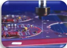
COMPOSITES & FIBERS