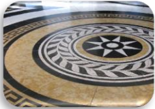
STONE & TILES